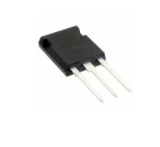
APT11F80B Microsemi Corporation MOSFET N-CH 800V 12A TO-247