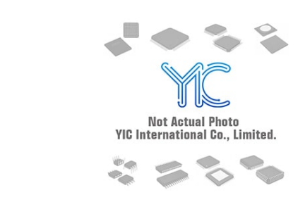
SP8003 ANAL SP8003 ANAL