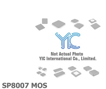
SAMHOP SAMHOP DFN-83.3X3.3