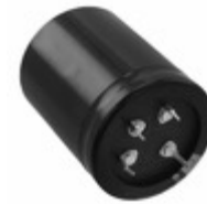
ECE-T1EA473FA Panasonic Electronic Components CAP ALUM 47000UF 20% 25V SNAP