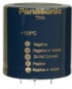
ECE-T1HA153EA Panasonic Electronic Components CAP ALUM 15000UF 20% 50V SNAP