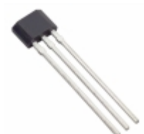
US4881LUA-AAA-000-SP Melexis Technologies NV MAGNETIC SWITCH TO92UA