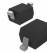
PMEG2010EA,135 Nexperia USA Inc. DIODE SCHOTTKY 20V 1A SOD323