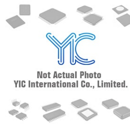
PMEG2010CEH NXP/PL PMEG2010CEH NXP/PL