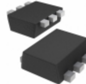
PMEG2010BEV,115 Nexperia USA Inc. DIODE SCHOTTKY 20V 1A SOT666