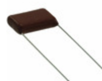
ECQ-E4224KF Panasonic Electronic Components CAP FILM 0.22UF 10% 400VDC RAD