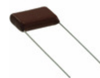
ECQ-E4224RKf Panasonic Electronic Components CAP FILM 0.22UF 10% 400VDC RAD