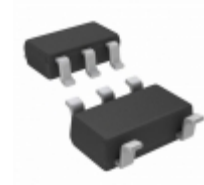
NC7SZD384M5 AMI Semiconductor / ON Semiconductor IC BUS SWITCH 1BIT LEVEL SOT23-5