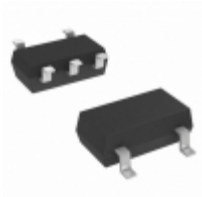
NC7SZ86P5 Fairchild/ON Semiconductor IC GATE XOR 1CH 2-INP SC-70-5