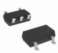
NC7SZ86P5X Fairchild/ON Semiconductor IC GATE XOR 1CH 2-INP SC-70-5