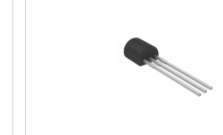
WeEn Semiconductors TRIAC SENS GATE 800V 1A TO92-3