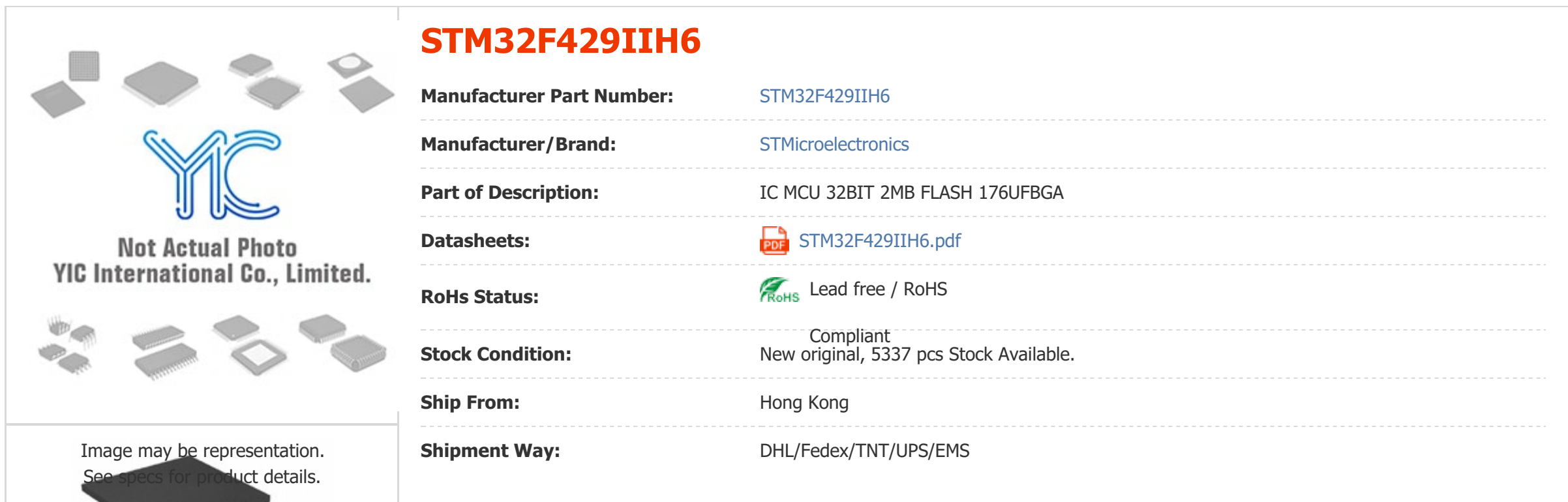
Image may be representation. See specs for product details.