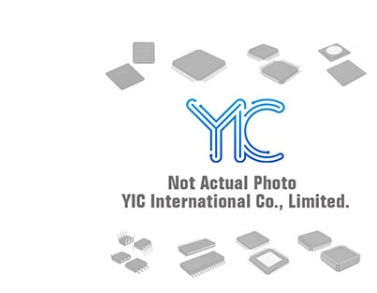
DS1233AZ-10+ IC N/A MAXIM SOT223