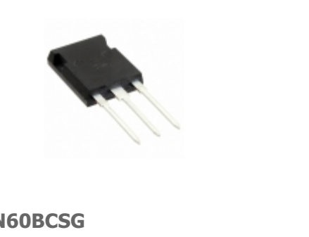
APT60N60BCSG Microsemi Corporation MOSFET N-CH 600V 60A TO-247