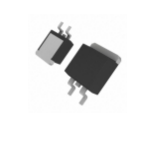
APT60N60SCSG Microsemi Corporation MOSFET N-CH 600V 60A D3PAK