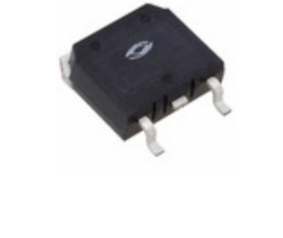
APT60S20SG Microsemi Corporation DIODE SCHOTTKY 200V 75A D3