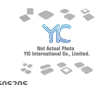
APT60S20S APT APT60S20S APT