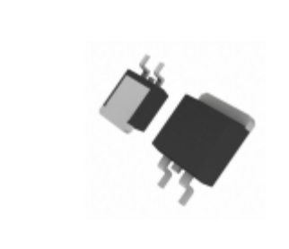
APT60N60SCSG/TR Microsemi Corporation MOSFET N-CH 600V 60A D3PAK