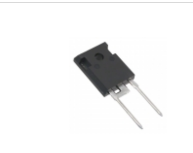
APT60S20BG Microsemi Corporation DIODE SCHOTTKY 200V 75A TO247