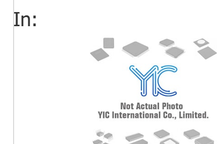
LD1117AL-2.85-A UTC UTC SOT-223