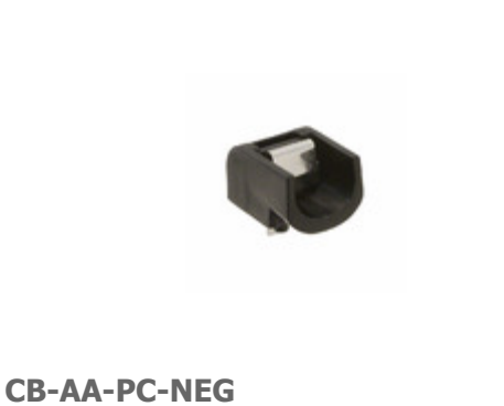
MPD (Memory Protection Devices) CONTACT AA BATT BLOCK NEG