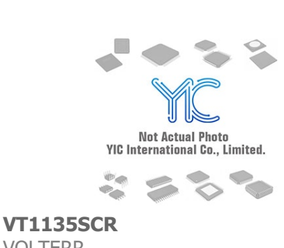
VOLTERR VT1135SCR VOLTERR