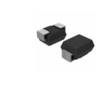
ON Semiconductor DIODE SCHOTTKY 60V 3A SMB