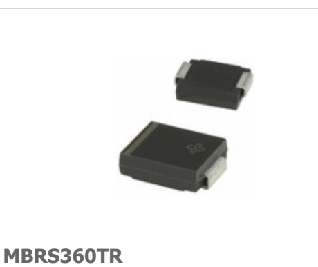
Vishay Semiconductor Diodes Division DIODE SCHOTTKY 60V 3A SMC