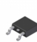
DMG4N60SK3-13 Diodes Incorporated MOSFET BVDSS: 501V 650V TO252 T&