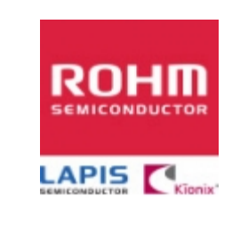
BD8271EFV-E2 LAPIS Semiconductor 3CH SYSTEM MOTOR DRIVER ICS FOR