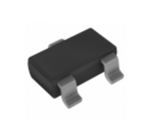
AP1702BWL-7 Diodes Incorporated IC MPU RESET CIRC 4.38V SC59-