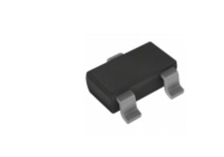
AP1702BWG-7 Diodes Incorporated IC MPU RESET CIRC 4.38V SC59-