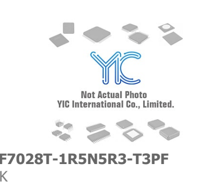
SLF7028T-1R5N5R3-T3PF TDK TDK SMD