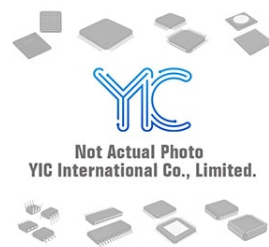
MBR40150PT NAMC MBR40150PT NAMC