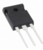
MBR40100PTE3/TU Microsemi Corporation DIODE SCHOTTKY 40A 100V TO- 247AD