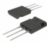
MBR40100PT C0G TSC (Taiwan Semiconductor) DIODE ARRAY SCHOTTKY 100V TO247