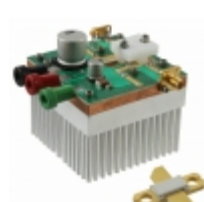
RF3932PCBA-411 RFMD RF EVAL FOR RF3932 PA