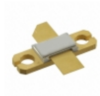
RF3931SQ RFMD RF AMP GAN 30W 3.5GHZ