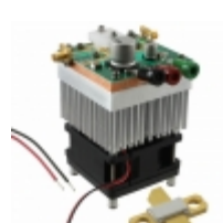
RF3934PCBA-411 RFMD RF EVAL FOR RF3934 PA