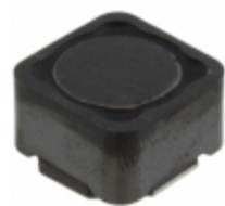
DRA127-R47-R Eaton FIXED IND 470NH 22.5A 1.2 MOHM