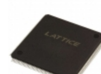
LC4384V-75T176I Lattice Semiconductor Corporation IC CPLD 384MC 7.5NS 176TQFP