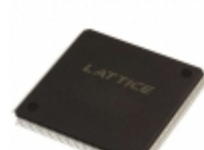
LC4384V-75TN176C Lattice Semiconductor Corporation IC CPLD 384MC 7.5NS 176TQFP