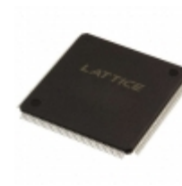
LC4384V-75TN176I Lattice Semiconductor Corporation IC CPLD 384MC 7.5NS 176TQFP