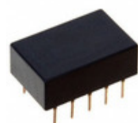
TQ2-L2-6V Panasonic Electric Works RELAY TELECOM DPDT 1A 6V