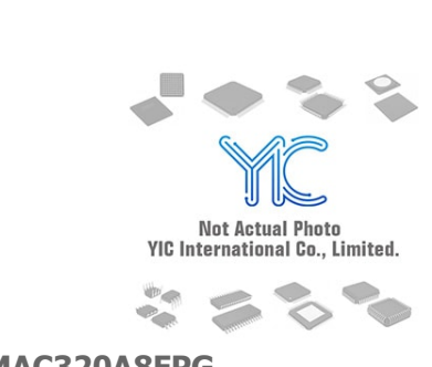
MAC320A8FPG ON TO-220F