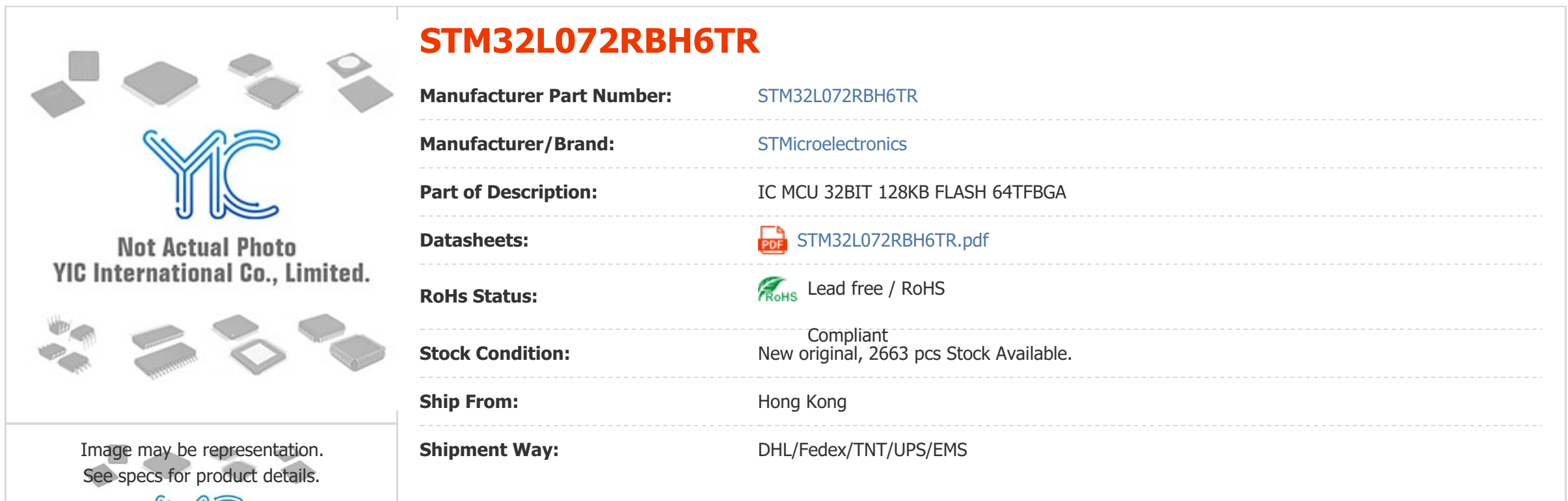
Image may be representation. See specs for product details.