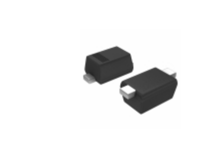
BB179,335 NXP USA Inc. DIODE UHF VAR CAP 30V SOD523