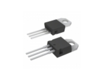
T2550-12T STMicroelectronics TRIAC ALTERNISTOR 1.2KV TO220AB