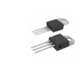
T2550-12I STMicroelectronics 1200V 25A SNUBBERLESS™ TRI