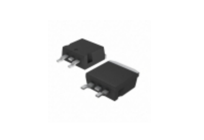
T2550-12G STMicroelectronics TRIAC ALTERNISTOR 1.2KV D2PAK