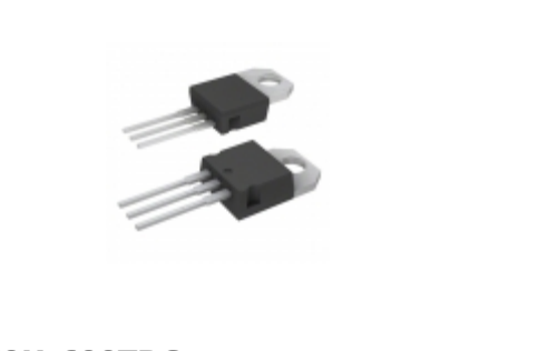
T2550H-600TRG STMicroelectronics TRIAC ALTERNISTOR 600V TO220AB