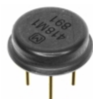
EFO-H418MS12 Panasonic Electronic Components SAW RES 418.0000MHZ T/H