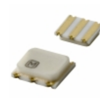
EFO-JM3385E5 Panasonic Electronic Components CER RES 33.8680MHZ 10PF SMD