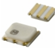
EFO-JM4005E5 Panasonic Electronic Components CER RES 40.0000MHZ 10PF SMD