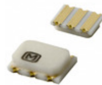
EFO-BM2005E5 Panasonic Electronic Components CER RES 20.0000MHZ 18PF SMD