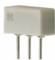
EFO-MC1005A4 Panasonic Electronic Components CER RES 10.0000MHZ T/H