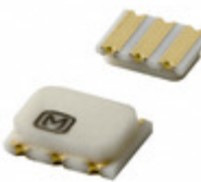
EFO-BM1605E5 Panasonic Electronic Components CER RES 16.0000MHZ 18PF SMD