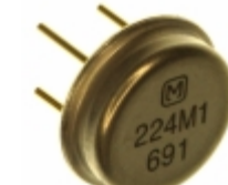
EFO-H224MS12 Panasonic Electronic Components SAW RES 224.5000MHZ T/H