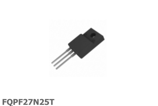
Fairchild/ON Semiconductor MOSFET N-CH 250V 14A TO-220F