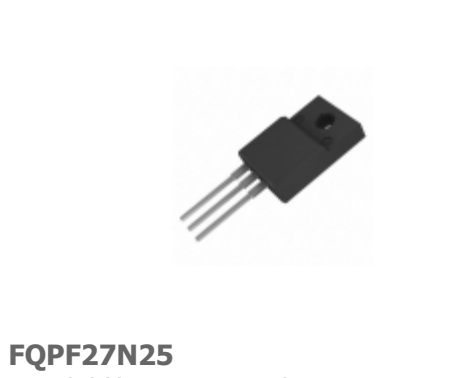
Fairchild/ON Semiconductor MOSFET N-CH 250V 14A TO-220F