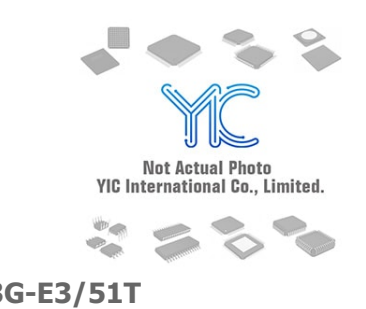
RS3G-E3/51T VISHAY RS3G-E3/51T VISHAY