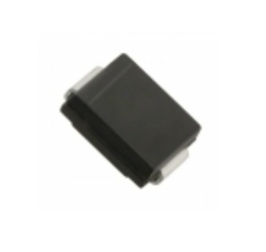
RS3G-13 Diodes Incorporated DIODE GEN PURP 400V 3A SMC