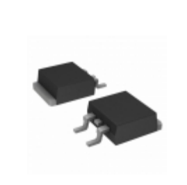
IRF730STRRPBF Vishay Siliconix MOSFET N-CH 400V 5.5A D2PAK