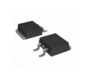
IRF730STRR Electro-Films (EFI) / Vishay MOSFET N-CH 400V 5.5A D2PAK