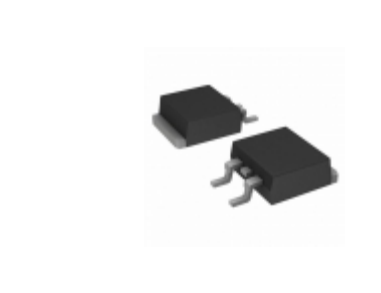
IRF730STRR Vishay Siliconix MOSFET N-CH 400V 5.5A D2PAK