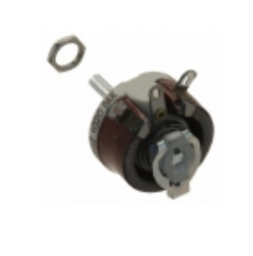
RES125 Ohmite POT 125 OHM 12.5W WIREWOUND LIN