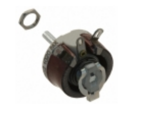
RES100 Ohmite POT 100 OHM 12.5W WIREWOUND LIN