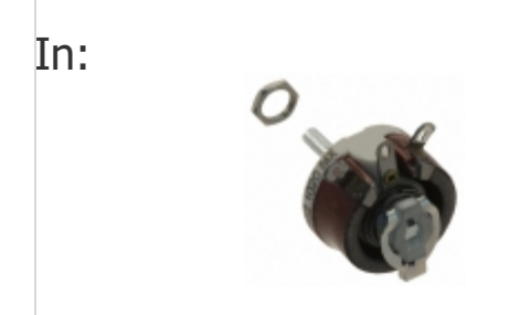
RES10K Ohmite POT 10K OHM 12.5W WIREWOUND LIN