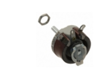
RES10KE Ohmite POT 10K OHM 12.5W WIREWOUND LIN