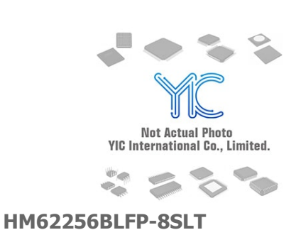
HITACHI HITACHI SOP