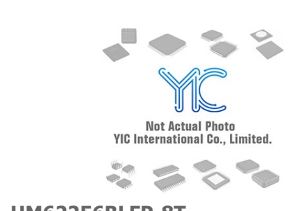
HM62256BLFP-8T HITACHI HITACHI SOP