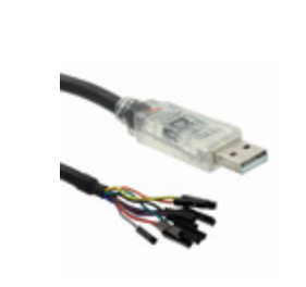
C232HM-DDHSL-0 FTDI (Future Technology Devices International, Ltd CABLE USB HS SPI/I2C/JTAG 3.3V