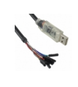
C232HD-EDHSP-0 FTDI (Future Technology Devices International, Ltd CABLE USB HS UART 5V, 1.8M