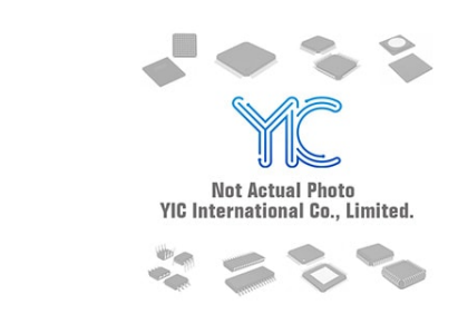
9248CF-199 ICS ICS SSOP48