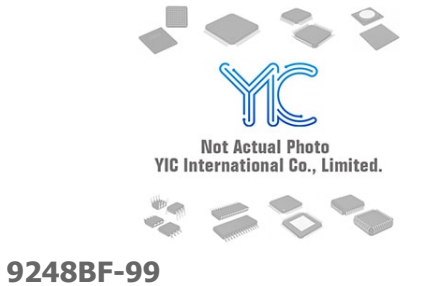
ICS 9248BF-99 ICS