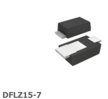
Diodes Incorporated DIODE ZENER 15V 1W POWERDI123