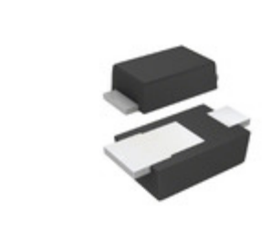
DFLZ16-7 Diodes Incorporated DIODE ZENER 16V 1W POWERDI123