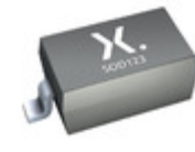
PMEG2005EGWJ Nexperia DIODE SCHOTTKY 20V 500MA SOD123