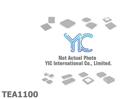
PHILIPS PHILIPS DIP16