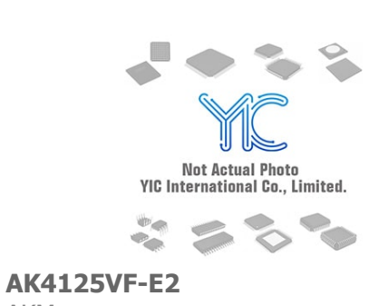
AKM AK4125VF-E2 AKM