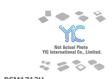
PCM1712U PCM1712U BB