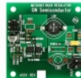
MC34063SMDBKGEVB AMI Semiconductor / ON Semiconductor EVAL BOARD MC34063SMDBKG