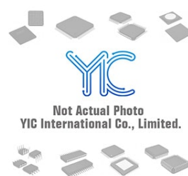
MC34063P ON MC34063P ON