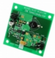
MC34063SMDBGEVB AMI Semiconductor / ON Semiconductor BOARD EVALUATION MC34063