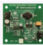
MC34063SMDBBGEVB AMI Semiconductor / ON Semiconductor EVAL BOARD MC34063SMDBBG