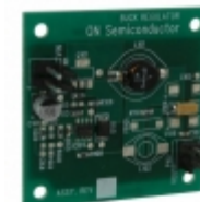
MC34063SMDBKEVB AMI Semiconductor / ON Semiconductor EVAL BOARD FOR MC34063SMDBK