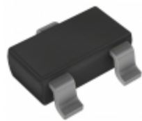
AZ23C22-7 Diodes Incorporated DIODE ZENER ARRAY 22V SOT23-3