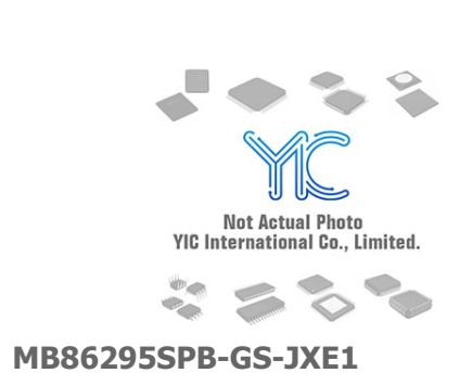
FUJITSU MB86295SPB-GS-JXE1 FUJITSU