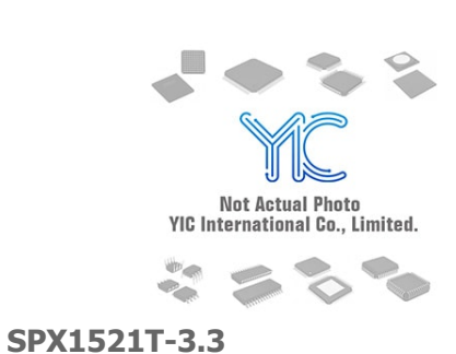
Sipex SPX1521T-3.3 Sipex