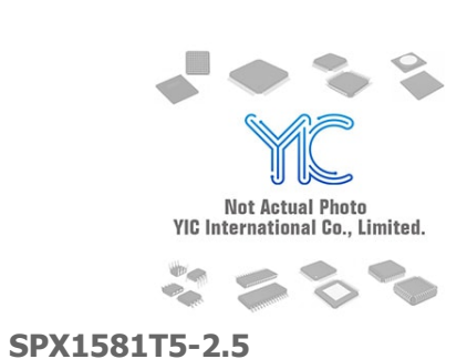
SIPEX SIPEX TO-263