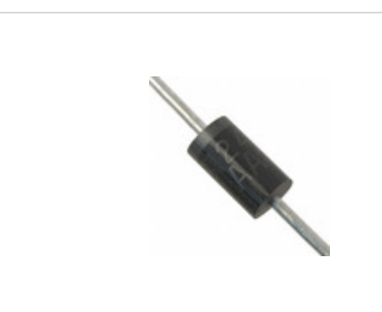
SB5100 Fairchild/ON Semiconductor DIODE SCHOTTKY 100V 5A DO201AD