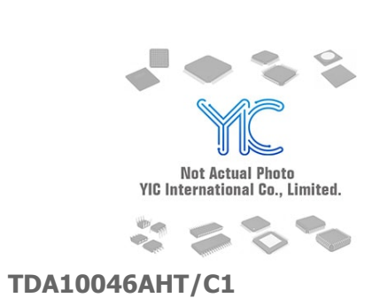
PHILIPS TDA10046AHT/C1 PHILIPS