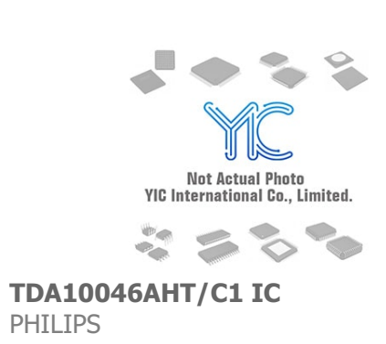
PHILIPS PHILIPS TQFP-64