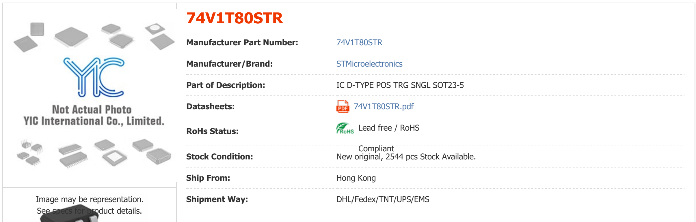
Image may be representation. See specs for product details.