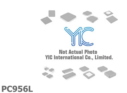
SHARP PC956L SHARP