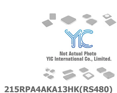
215RPA4AKA13HK(RS480) ATI BGA