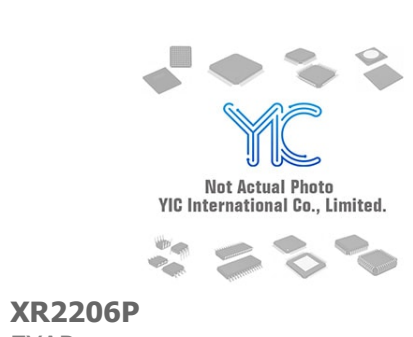
EXAR XR2206P EXAR