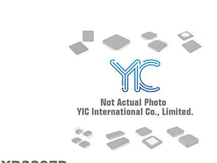
XR2207P XR XR DIP